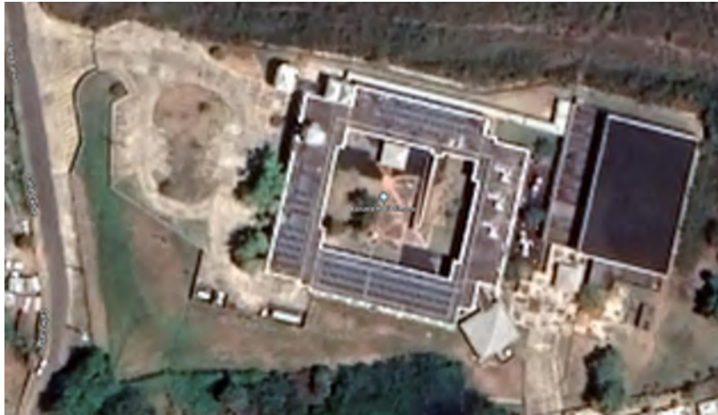
35840 – ESC. MARIA M. SIMMONS DE RIVERA CARR.P.R. 993 KM. 2.0 CARR. 200 BO. CAFÉ, VIEQUES, PR 00765 MUNICIPIO DE VIEQUES