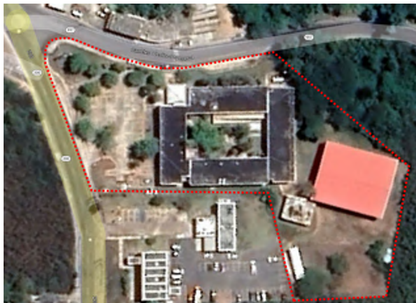
35295 - ESC. 20 DE SEPTIEMBRE DE 1988 CARR. 200 ESQUINA 997, VIEQUES, P.R. 00765 MUNICIPIO DE VIEQUES